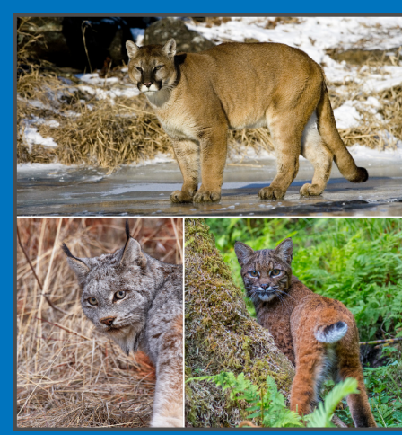
Wild cats of BC: cougar (top), lynx (bottom left), bobcat (bottom right).

Large prey takes a number of days to eat and the cougar will pull debris over the carcass to keep off scavengers. The cougar will stay near a kill site until the prey is totally consumed. If you find a kill site, leave the area immediately.